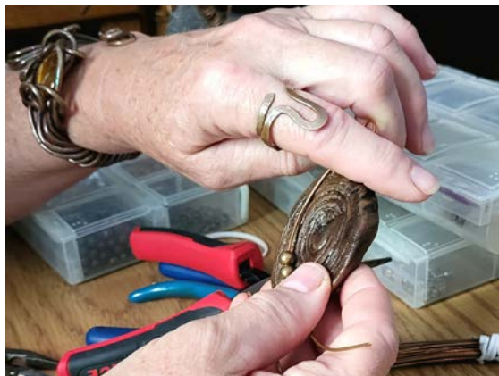
Tiger eye bracelet (copper), Hawk's Peninsula ring (copper), and Potomac River driftwood