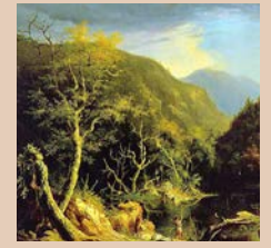
Focus on the Arts Page 8