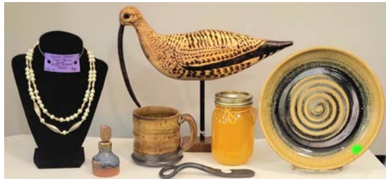
A small sample of items available at our expanded Holiday Shoppe. The Shoppe opens November 9.