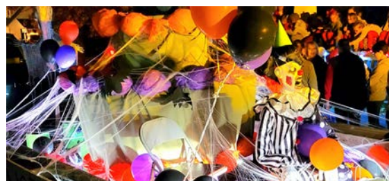
Our Halloween parade float celebrating our 50th year

Keep in mind that if a stock has lost value and you want to get rid of it, a better option is to sell the stock and donate the proceeds so you can take the tax loss. Either way, donating stocks is a great way to help nonprofits like the Arts Council while not cutting into your cash assets.