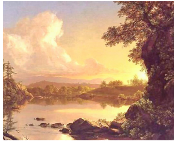
Frederic Edwin Church, Scene on the Catskill Creek , 1847

Albert Bierstadt (1830-1902), who moved from Germany to the United States as a child, was another prominent member of the Hudson River School. After painting in the Hudson Valley and elsewhere in New England, he traveled west and created large paintings of the Rocky Mountains, the Yellowstone River area, and Yosemite Valley. His dramatic landscapes (such as his painting of Cathedral Rocks) helped to