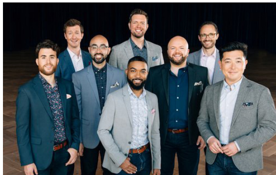
The vocal ensemble Cantus will give a free mini-concert on Saturday, November 12.

Join us for this free, 45-minute concert.