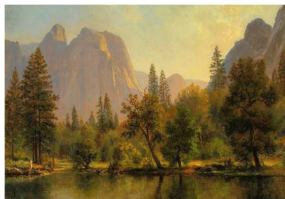
Albert Bierstadt, Cathedral Rocks, Yosemite Valley , 1872

Although there were few professional women paint-