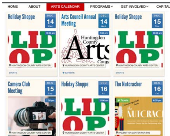
The Arts Calendar tab on our website hosts a rotating list of local arts events, with detailed information on each