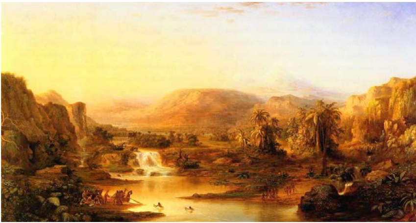
Robert Duncanson, Land of the Lotus Eaters , 1861