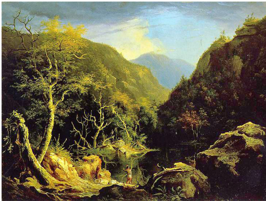
Thomas Cole, Autumn in the Catskills , 1827

Thomas Cole (1801-1848) was the founder of the Hudson River School. He immigrated to the United States from England as an adolescent and lived for a while in Ohio and Pennsylvania before moving to Catskill, New York. From there he hiked deep into the forest and painted directly from nature. Autumn in the Catskills (1827), which shows a small human figure surrounded by verdant forests and towering mountains, was typical of his work. As Cole's paintings became popular, other artists began to imitate his naturalistic style.