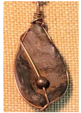
Bog iron ore jewelry with a bronze bead enhancement

Many people prefer to purchase jewelry from big chain stores, as Teri noted, because they like the predictable, standardized look. But hand-made jewelry involves unique, one-of-a-kind adornments that generally are more interesting. Check out some of Teri's beautiful and distinctive creations the next time you are in the Art Shoppe.