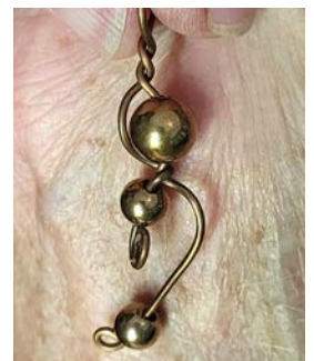
A simple bronze wire wrap with bronze beads