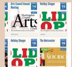
Arts Calendar Online Page 5