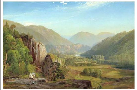
Thomas Moran, The Juniata, Evening , 1864

One can read different meanings into any school of art. Some critics say that the Hudson River School artists, by focusing the public's interest on the American frontier, helped to popularize the doctrine of "manifest destiny" and paved the way for westward expansion and the eventual destruction of the very wilderness they sought to praise. It's also true, however, that these artists preserved in glorious images what much of America looked like before it was desecrated with highways, billboards, strip malls, gas stations, and fast food outlets. These great works of art remind us how much of the American wilderness has been lost and how important it is to protect our remaining natural areas from further despoilment.