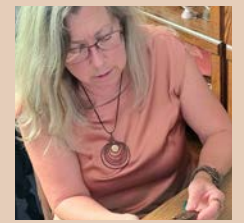
Artist Spotlight Page 10