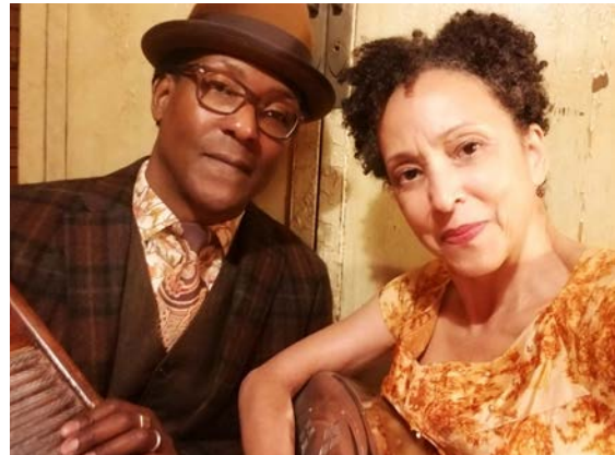
Country blues duo Piedmont Bluz will perform at this year's Folk College

For more details on how to participate in Folk College and hear these great performers in concert, go to www.folkcollege.com .