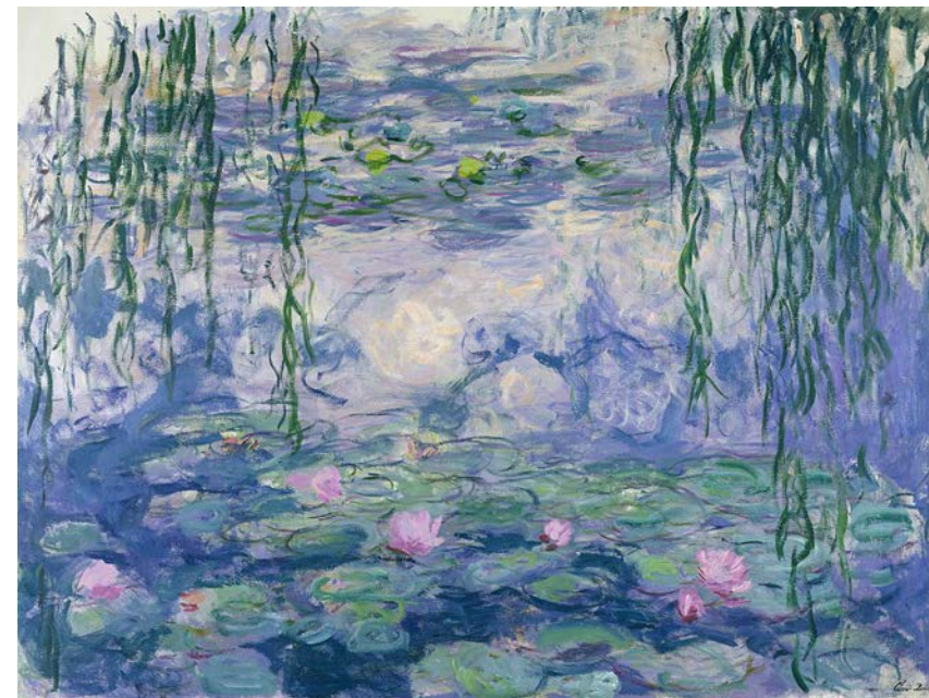
Claude Monet, Water Lilies , 1910