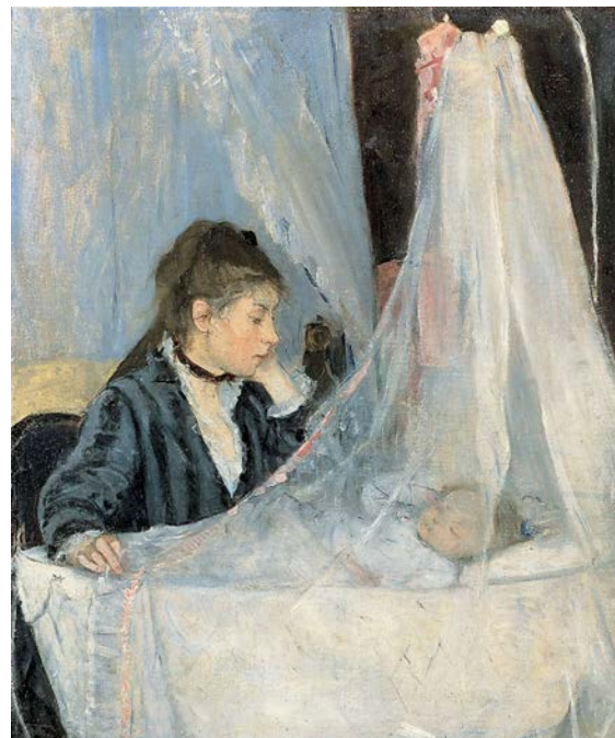
Berthe Morisot, The Cradle , 1874

The Cradle is one of Morisot's most popular paintings. It depicts the artist's sister