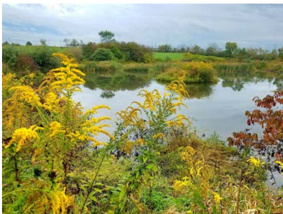
A variety of art forms at the February exhibit illustrate the Old Crow Wetland through the seasons

To enter the Art Cat Jazz Club, walk down the steps continued on Page 5