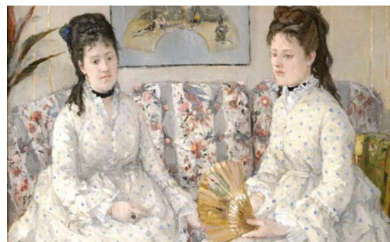
Berthe Morisot, The Sisters , 1869

Impressionism waned by the end of the 19th century, but it opened the door to more expressive, subjective, and even outlandish styles of art to follow, including pure abstraction. To this day, Impressionism remains a popular and much loved style of painting, and examples can be seen regularly in books, posters, postcards, and calendars. Anyone who has had the privilege of viewing, in person, Monet's wall-size canvases of luscious water lilies, which he painted frequently during the last two decades of his life, will understand why.