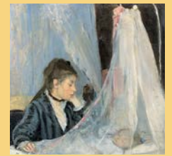
Focus on the Arts Page 8