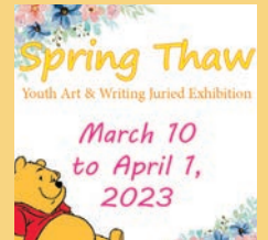
Spring Thaw Page 3

Old Crow, located near the intersection of Routes 22 continued on Page 5