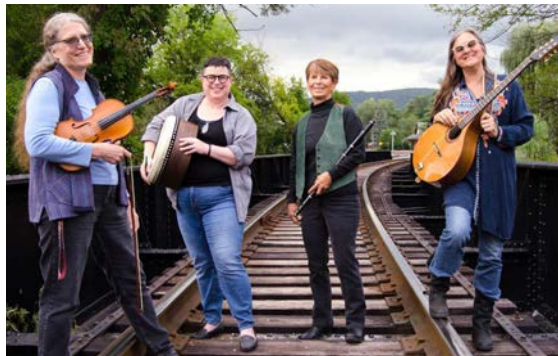
Callanish will help us celebrate St. Patrick's Day with an Irish music concert on Wednesday, March 15 at 7 p.m.

Our early concerns, however, are gradually being laid to rest. The Arts Center is proving to be a comfortable concert venue with great acoustics, and we have enticed many outstanding artists