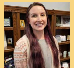
Artist Spotlight Page 10