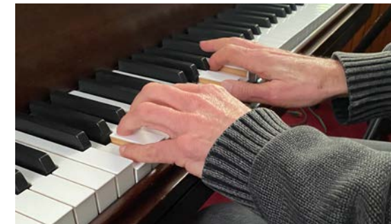
Tickling the black and white keys: Keyboard Fest at the Arts Center on Sunday, February 19 at 2 p.m.