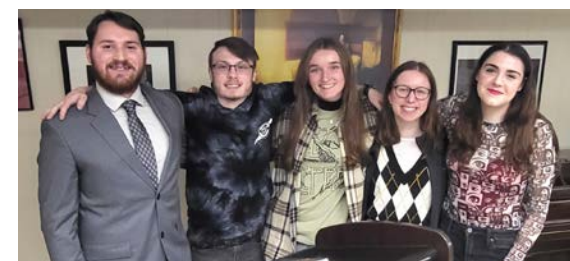
Students from the Juniata College Poetry Club at the Poetry Open Mic

Local poets and poetry fans had an opportunity to get together on January 21 at the Arts Center. The afternoon event attracted 22 people, including a group of students from the Juniata College Poetry Club. A total of 12 individuals presented various types of poems, many of which were original. Beverages and snacks were provided, and some time was available afterward for discussion and socializing. This enthusiastic group demanded more poetry in the future! So the next Poetry Reading will happen during National Poetry month, on Sunday, April 16 at 2 p.m.