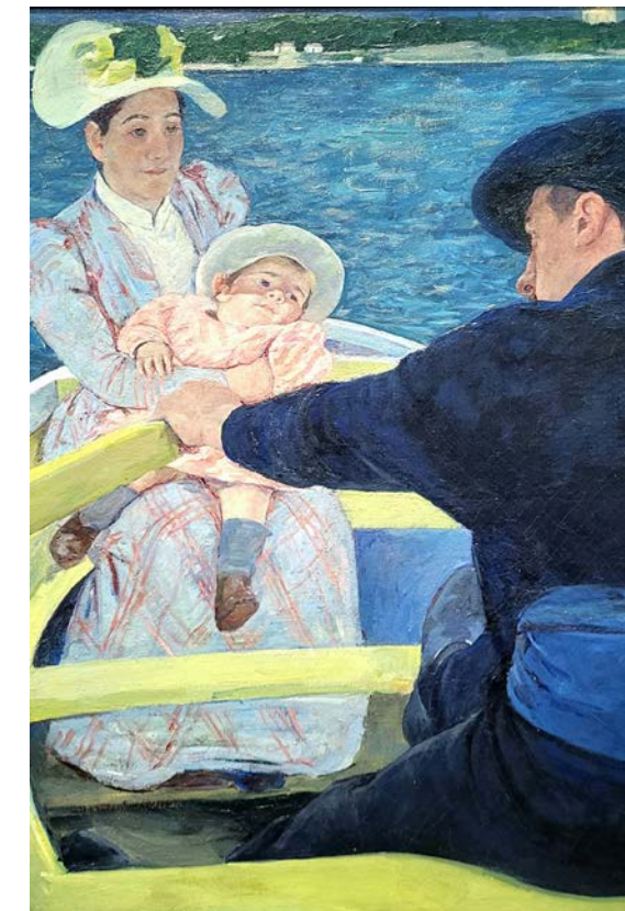
Mary Cassatt, The Boating Party , 1883

Although Cassatt painted landscapes and portraits, her best-known paintings focused on women, children, and