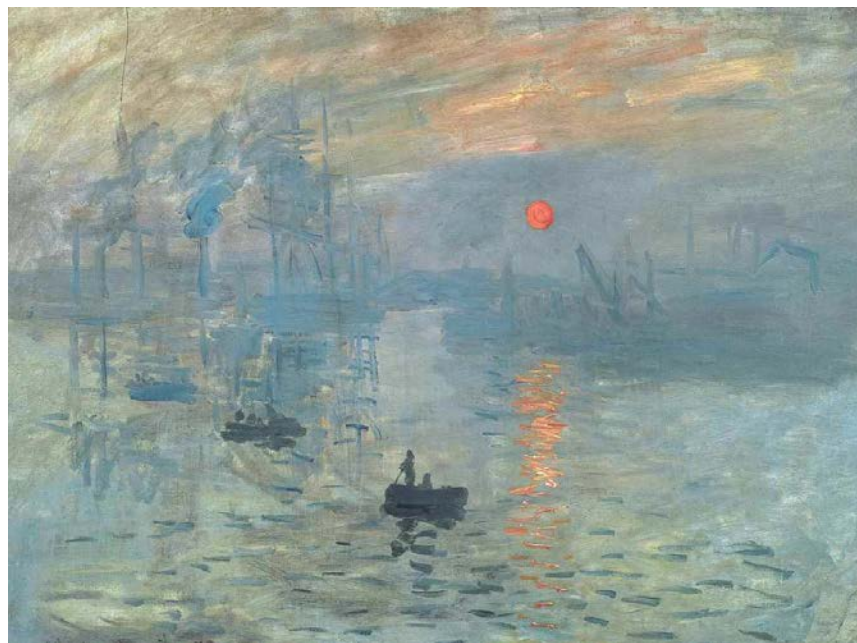
Claude Monet, Impression, Sunrise , 1872

A key event in art history was the Impressionist exhibition in Paris in 1874, which featured works by many of these young artists. A painting at the exhibit by Claude Monet (1840-1926) of a harbor, Impression, Sunrise , gave the emerging style its name. Despite the fact that early critics dismissed Impressionism and even ridiculed it, the movement had a major influence on the subsequent development of modern art.