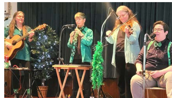
Callanish performs for St. Patrick's Day at the Arts Center

Callanish, a popular Irish musical act, performed on March 15, just in time for Saint Patrick's Day. The five musicians played a variety of jigs, airs, and reels that had people tapping their feet and wishing they could dance in the aisles. The group entertained the audience with a variety of instruments, including flute, concertina, fiddle, guitar, baouzouki, drums, and banjo.