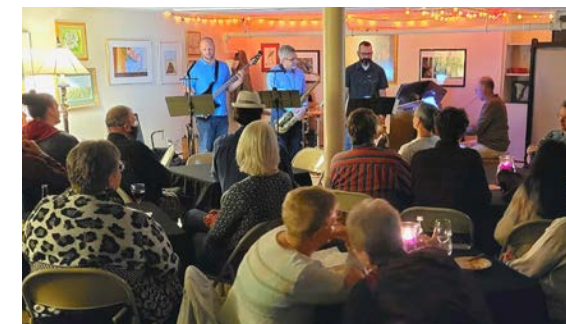
No Filter Jazz performs at the Art Cat Jazz Club

Our effort to turn the basement of the Arts Center into a jazz club was a big success. The room was decorated to resemble a 1920s speakeasy, with dim lights, candles, and lots of ambiance. The band, No Filter Jazz , was hot, and the audience responded to their spirited renditions of jazz standards with copious rounds of applause. Standing Stone Coffee Company provided delicious snacks, and