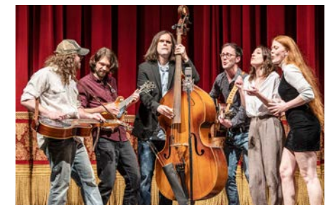
Buffalo Rose will be at Folk College

We pride ourselves on providing a fun and friendly weekend, and we go out of our way to make Folk College a welcoming, encouraging environment. For more details on how to participate in Folk College or to hear these great performers in concert, go to www.folkcollege.com or call 814-643-6220.