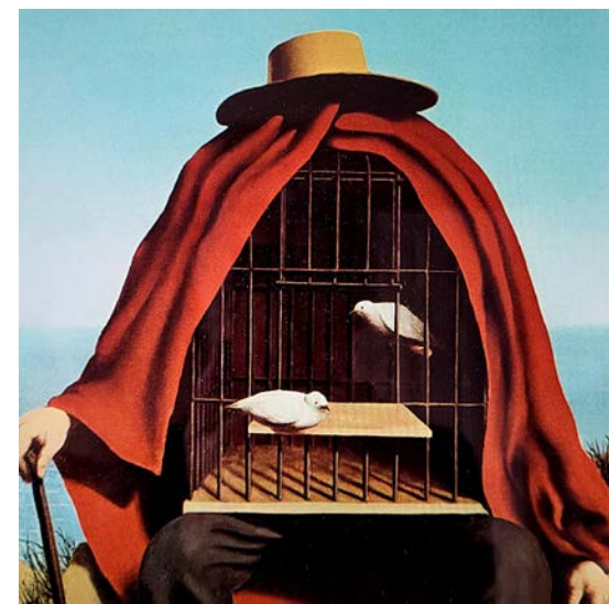
Rene Magritte, The Therapist

Cubism was relatively short lived, and most cubist painters, such as Picasso, went on to explore other styles of art in their careers. Nevertheless, cubism had an important influence on subsequent art movements, such as surrealism.