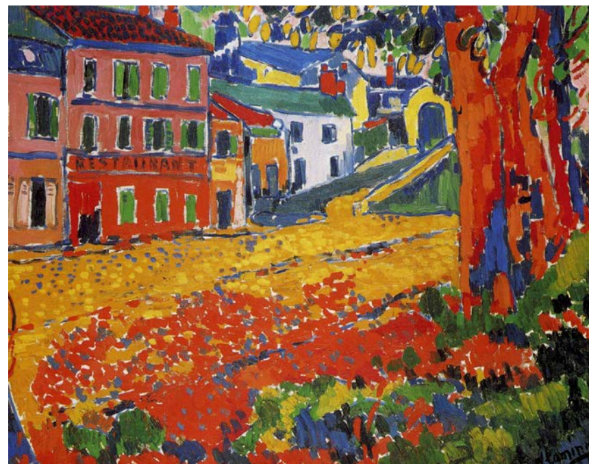
Maurice de Vlaminck, Restaurant de la Machine à Bougival

The term “Fauvism” derives from the French word for “wild beasts.” (Conservative art critics at the time derided their work as wild and savage.) Some of the key artists