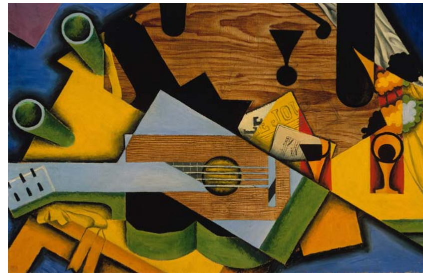
Juan Gris, Still Life with a Guitar

In contrast to the bright canvases of the Fauvists, cubists tended to use neutral colors, like gray, brown, and black. The 1913 painting by Juan Gris, Still Life with a Guitar , shows how the artist took elements of the scene (guitar, table top, music, newspaper, glasses) and reorganized them into a unique configuration. Many cubists also incorporated collage elements, such as pieces