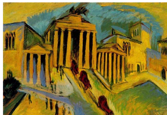
Ernst Ludwig Kirchner, Brandenburg Gate

associated with this movement were Andre Derain, Maurice de Vlaminck, and Henri Matisse. The painting shown here by Vlaminck (painted in 1905), with its intense colors, is typical of this style. Fauvism was short lived, but its emphasis on individual expression and the free use of color influenced many subsequent artists.