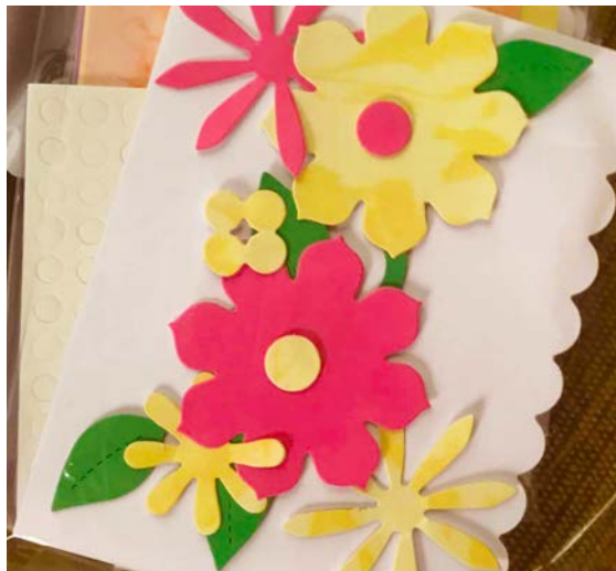
Card Making, a workshop for adult beginners, is one of the three beginner workshops on Thursday, September 7