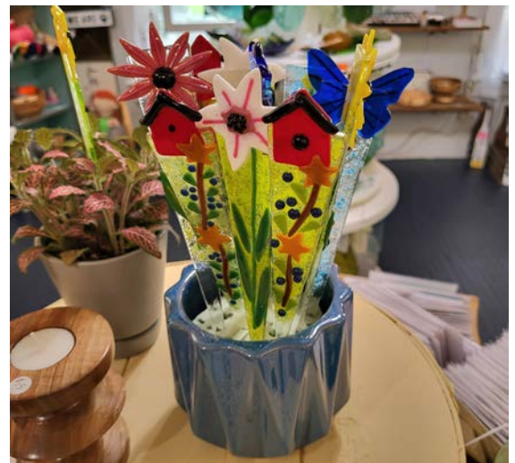
Decorative glass garden stakes at B Fisher Creations

Barb provides art lessons for children most