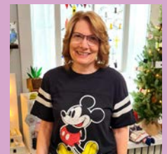
Artist Spotlight Page 10