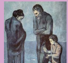
Focus on the Arts Page 8