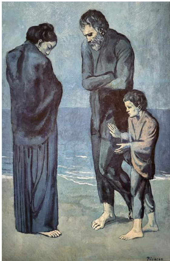
Pablo Picasso, The Tragedy , 1903

5. Understanding the historical and cultural context of art can enhance your appreciation. It's useful to know something about the context of the artist, the culture, and the art movements of the time. This knowledge can provide additional insight into the intended meaning of the art.