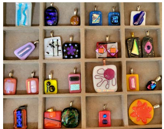
Glass ornaments at B Fisher Creations