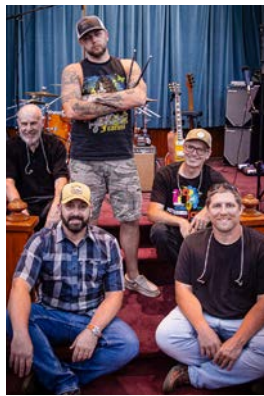
Stone Creek Blues Band