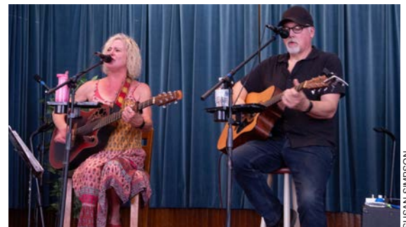
The State College duo Biscuit Jam played on June 10 at our one day Celebration of the Arts