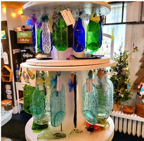
Glass service trays at B Fisher Creations

few moments to enjoy the plethora of glass ornaments, garden stakes, service trays, night lights, and window hangings, along with greeting cards, painted signs, and other items of interest. Say "Hello" to Barb while you are there. And perhaps you will find a beautiful, handmade, reasonably priced object d'art to take home with you.