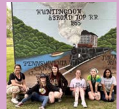
Trestles Repainted Page 3

Visitors will see demonstrations of fiber arts skills, such as spinning, rug hooking, and wire wrapping. There will be "Make & Takes" for all ages to try their hands at. And vendors will offer a variety of fiber arts continued on Page 9