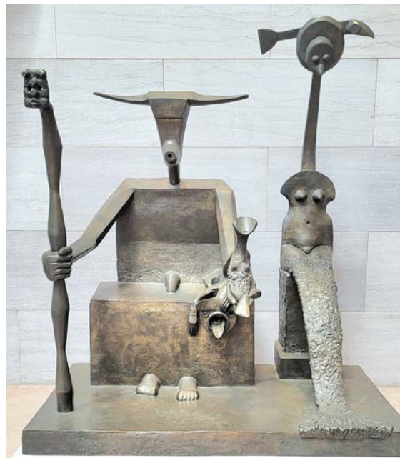
Max Ernst, Capricorn , 1948

The title immediately tells us the theme, but no-