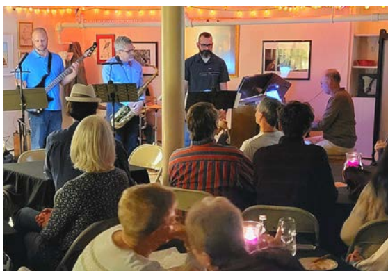
No Filter Jazz at the Art Cat Jazz Club in March