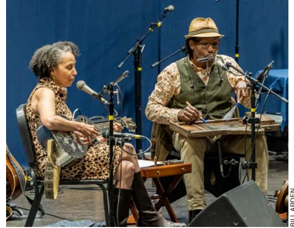
Piedmont Blüz performed at Folk College