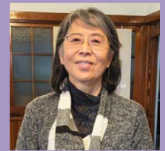
Artist Spotlight Page 10