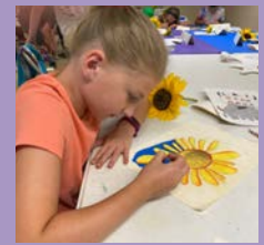
Kids Art Camps Page 7