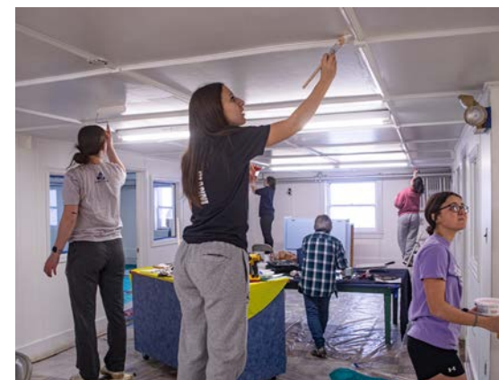
The Juniata College Women's Soccer Team and a number of board members were recently busy giving both the Art Shoppe and the classroom area a much needed paint job.

You also can renew your membership, or become a new member, online at huntingdoncountyarts.com , or at the Arts Center during our regular opening hours. We sincerely appreciate our members, and we hope to see you at an Arts Council event in the near future.