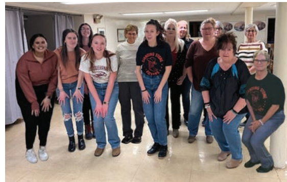
The Standing Stone Kickers at the Arts Center

to a varied group of individuals from ages nine to 79 in church basements, firehalls, public parks, and malls. She brought back the dances from that era and added some more recent line dances and geared them to the general population.