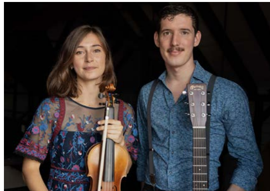
Rakish will perform Celtic & traditional American folk music at the Arts Center on Sunday, March 24, at 2 p.m.

Audience attendance has ranged from 22 to 95 people, with an average of 45. We try to keep the ticket prices realistic—just enough to cover the cost of the musicians plus a small profit for the Arts Council. The small profit allows us to stage occasional musical events free of charge throughout the year. We also receive generous support from Standing Stone Coffee Company for our concerts.