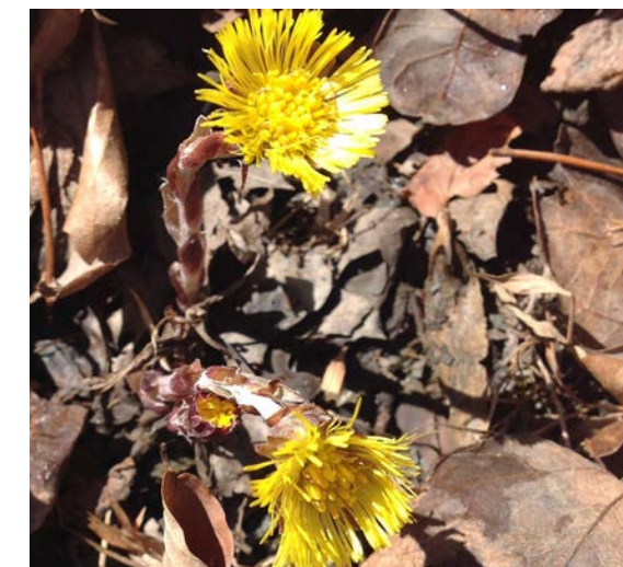
Coltsfoot, an early spring bloomer