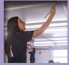
Painting Project Page 3