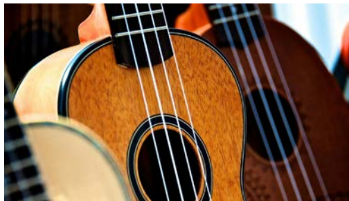
Free music lessons are being offered for veterans to learn the basics on how to play the ukulele

For more details and/or to register, call the Arts Council at 814-643-6220, or check out this page of our website: huntingdoncountyarts.com/programs/free-music-lessons-for-veterans/ .