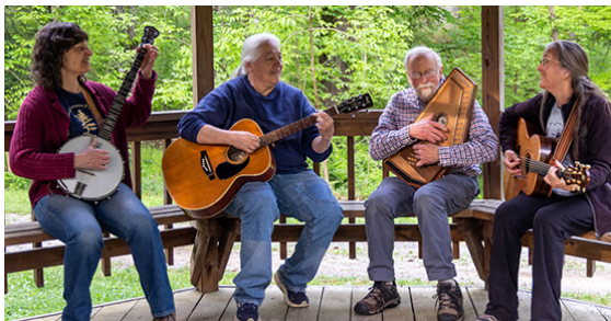
Our annual Greenwood Furnace Folk Gathering music camp is moving and changing its name too. The now Pennsylvania Folk Gathering will be held at Camp Blue Diamond in Petersburg.

See the complete details, including dates and costs for the above classes and workshops on pages 8 and 9.