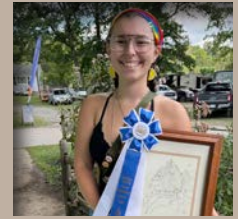
Arts at the Fair Page 6

The event will feature several types of activities for your enjoyment and inspiration. There will be demonstrations of a variety of art forms, including painting, continued on Page 2