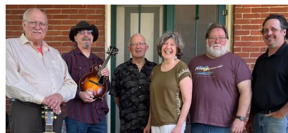
The Tussey Mountain Moonshiners, along with Simple Gifts, are the featured performances at Pennsylvania Folk Gathering. They will perform at a free concert on Saturday, September 14 at 7 p.m. at Camp Blue Diamond.