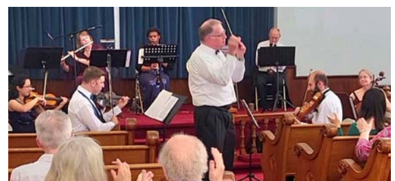
Vienna Serenade had everyone clapping along

On Sunday, June 2, the spirit of old Vienna was alive at the Arts Center when the members of a relatively new ensemble, Vienna Serenade , switched on their musical time machine. People were tempted to waltz in the aisles to the rhythmic sounds of Johann Strauss (Senior and Junior). The Radetzky March had people clapping along and stomping their feet. This group really knows how to engage an audience.