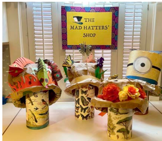
Visit the Mad Hatter's shop at the FREE Celebration of the Arts on Saturday, October 5, and let your imagination take off! A variety of materials and decorations will be available for your use in creating your hat. This could be the start or finishing touch to a Halloween costume.