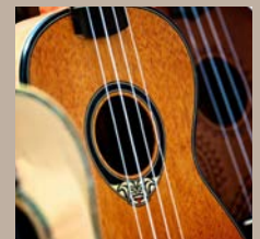
Music for Veterans Page 12