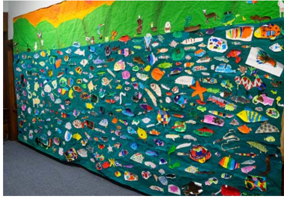
Lake Raystown mural by Standing Stone Elementary School students

We thought it was an appropriate theme since the dam at Lake Raystown was dedicated in June of 1974. We had nineteen artists display thirty-six artworks in a variety of forms for a wonderful exhibit. The exhibit included the very large paper mural of Lake Raystown from Standing Stone Elementary School. The exhibit ran from May 10 to June 8.