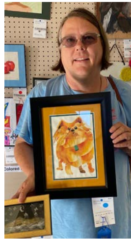
At the 2022 county fair