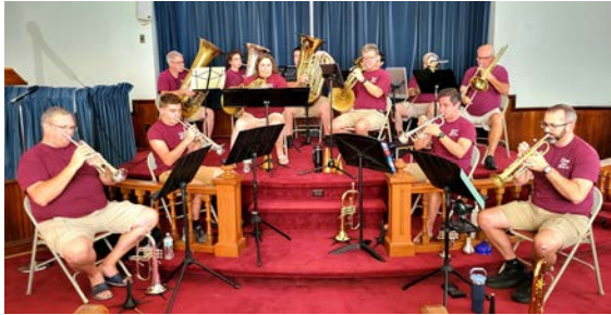
Members of The Altoona Brass Collective filled the stage at the Arts Center

We love brass bands because they combine powerful instruments with precise playing, creating an energetic, and thrilling sound. The Altoona Brass Collective made their debut