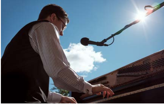
Seven outstanding ragtime musicians will perform at the Arts Center on Thursday, September 12.

musicians. This is an opportunity to hear some of the top ragtime musicians in the country, right here in Huntingdon. Fans of ragtime and old American music should check out the festival website at rockhillragtime.com for details on the full range of musical activities over the weekend. Tickets: $30 for general admission, $24 for members.