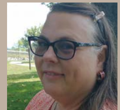
Artist Spotlight Page 10