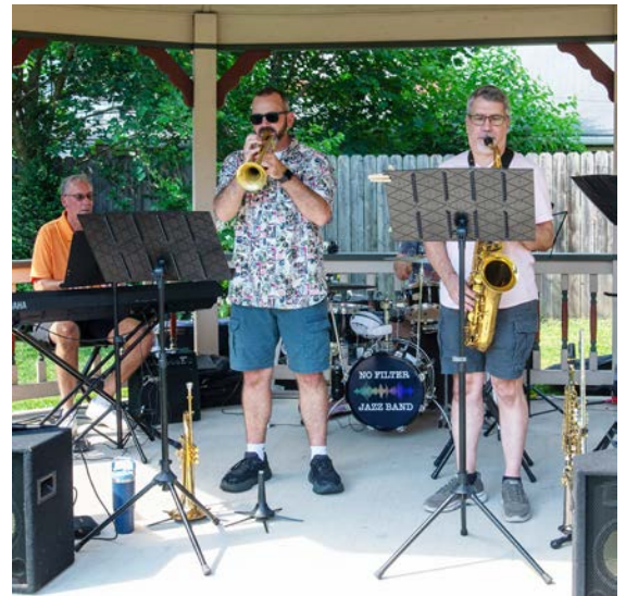
No Filter Jazz brought their great jazz sound to the Summer Solstice Party at the Gage Mansion