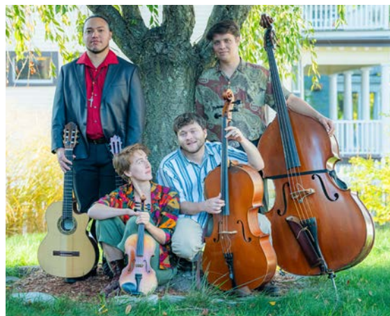
The Acoustic Nomads will feature South & North American music as part of the Folk College Saturday concert.

As part of Folk College, a live folk music concert is open to the public. The Friday, May 23, concert features host band, Simple Gifts ; the English, Celtic & Baroque music of the Chivalrous Crickets ; the country blues sound of the Piedmont Bluz Acoustic Duo ; and the progressive acoustic bluegrass sound of High Horse . The concert is at 7 p.m., at the Halbritter Center on the Juniata College campus. Tickets are available in advance and at the door and are $20 for general admission and $16 for members. There is a free Ceilidh dance after the concert.