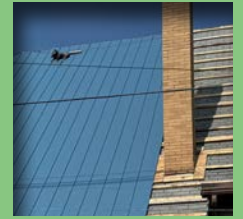
Building Updates Page 2

The start time for the tours alternate between 10 a.m. and 6 p.m., except for the pre-fireworks tour on July 3, which begins at 8 p.m. Tours begin at several different locations. A tentative schedule follows, but it would continued on Page 12