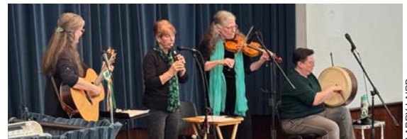
Callanish delivered a great St. Patrick's Day concert