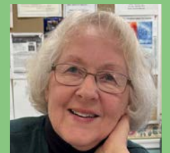
Artist Spotlight Page 11