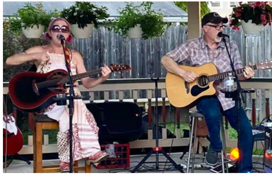
Biscuit Jam will be one of two musical acts at this year's Summer Solstice Party at the Gage Mansion on Friday, June 20. The event features a summertime picnic themed meal and a cash bar.

Folk College is a collaboration between Simple Gifts of State College and the Huntingdon County Arts Council. It has been an annual traditional-music-fest for over 25 years. The event brings in nationally recognized musicians, as instructors, and offers workshops to both budding and seasoned acoustic musicians over