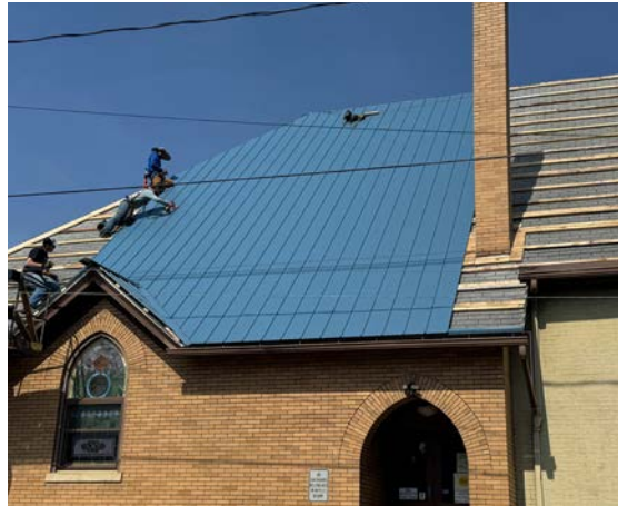
Progress on the roof replacement project with our beautiful blue metal roof at the Arts Center