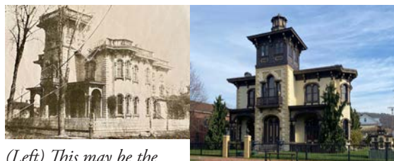
(Left) This may be the earliest surviving image of the Woods Mansion ; (Right) The Woods Mansion as it appears today.