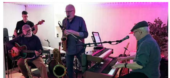
The Triple A Blues Band at the Art Cat Jazz Club

The Art Cat Jazz Club was rockin' on the evening of March 8 when the Triple A Blues Band , another one of State College's popular musical acts, shook the Arts Center jazz club. They had the crowd dancing the night away. In addition to the lively, danceable music, people enjoyed a wonderful buffet and our new signature drink, the Art Cat catmopolitan .