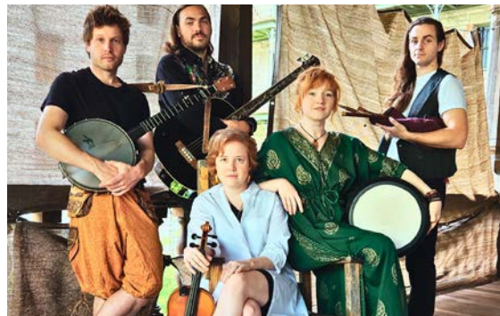
The Chivalrous Crickets will one of four groups performing at the Folk College Friday concert on May 23.