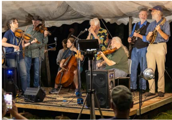
The Pennsylvania Folk Gathering offers free evening concerts on Friday and Saturday nights, September 12 & 13 at Camp Blue Diamond.

All in all, there are many great opportunities to avail yourself of the arts.