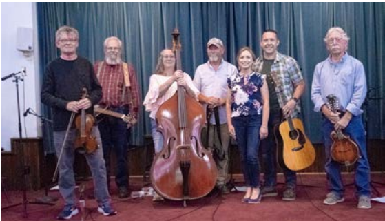
Open Timbre at the Celebration of the Arts