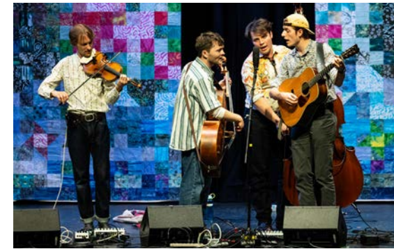
High Horse brought with their progressive bluegrass sound and youthful energy to Folk College.

Whether folks came hoping to "up their musical game" by learning new riffs, sampling unfamiliar musical styles, or picking up a new instrument, none left disappointed in the experience. And speaking of picking up a