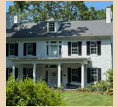
Cultural Spotlight Page 10