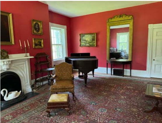
The main front room in the mansion is often used for indoor entertainment events.

Upcoming events include an artist residency and painting workshop with Lynn Margileth, archeology field workshops, and blacksmithing demonstrations. On July 26, the grounds will be the home of Ukraine at Colerain , a day of music, crafts, entertainment, children’s activities, and authentic Ukrainian food to celebrate Ukrainian culture.