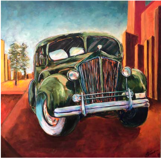
Original oil painting by Lynn Stewart

The total cost for the class is $45 for members and $50 for nonmembers.