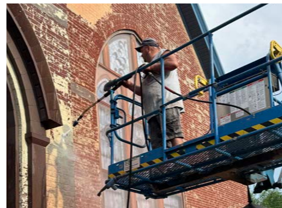
The next phase of building upgrade is in process.