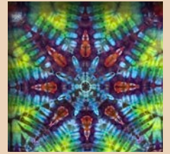
Fall Classes Page 6 - 8

The Art Council's Celebration of the Arts was held at the Arts Center on June 14. Musical/performance pieces continued on Page 12