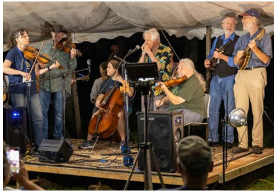
The Pennsylvania Folk Gathering offers free evening concerts on Friday and Saturday nights, September 12 & 13 at Camp Blue Diamond.

All in all, there are many great opportunities to avail yourself of the arts.