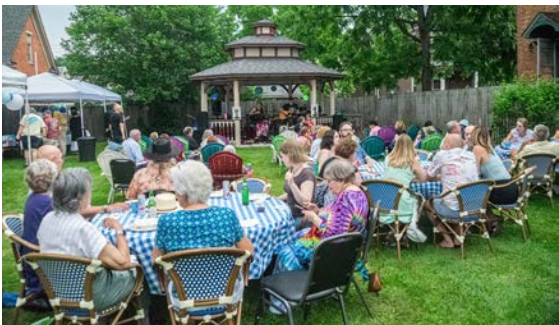
A great turnout at the Gage Mansion to celebrate the summer solstice AND to help fundraise for the Arts Council.

For the 4th year in a row, we held our Celebration of the Arts on Saturday, June 14. This open house event featured workshops, demos, music, and a performance by three dancers from the Huntingdon Dance Academy. In addition, Sam's Hot Dogs provided lip-smacking hot dogs that were a crowd favorite. The Girl Scouts also featured fun activities for community members. The Huntingdon County Humane Society showcased baked goods for both canines and pet parents. Trinity came by to give 5 "paws" at the event.